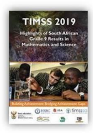
Grade 9 Highlights